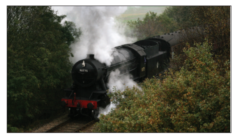
No.90775 on the line below Kelling Heath.