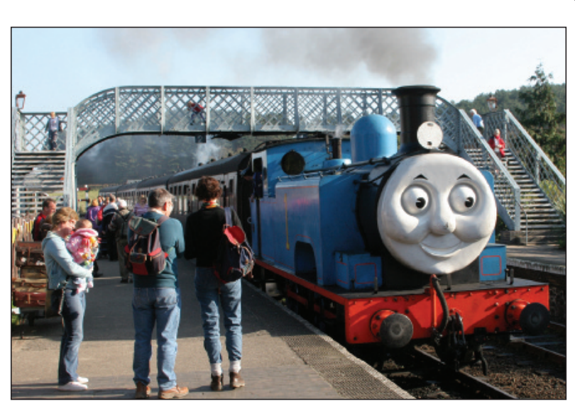
Thomas the tank engine is always a favourite with the children.